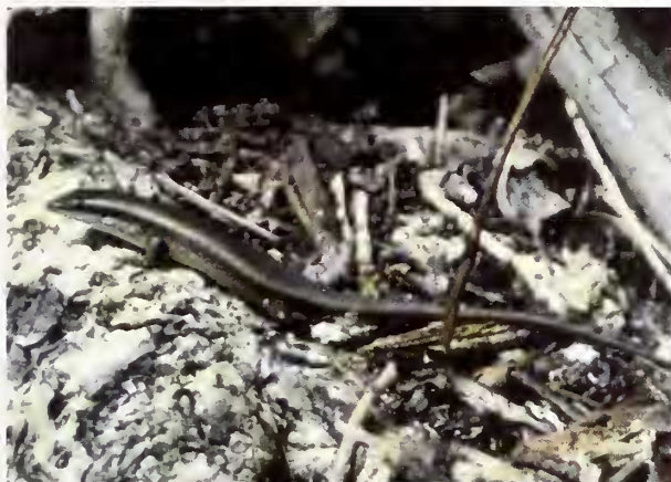
Fig. 11. Eutropis m. multicarinata from Salibabu Island.

Additional material: ZMA 18454 (1 spec.), Beo, Karakelong, coll. M. WEBER 1899.